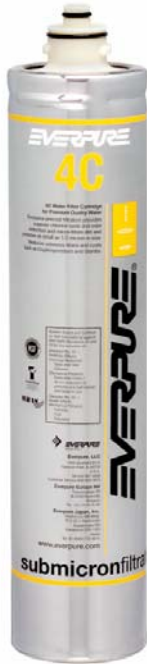
4C Replacement Cartridge EV960100

Delivers premium quality water for cold cup vending applications