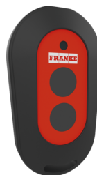
2-button remote control for fittings F3 and F5