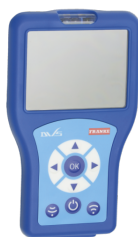
Bidirectional remote control for electronic fittings F3 and F5