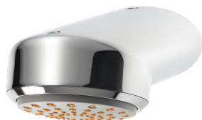
AQUAJET-Slimline shower head for F5 shower panels