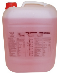
LIQUID SOAP: SO10L