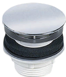
Dome waste valve