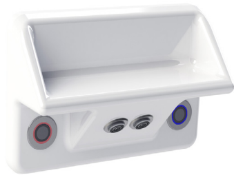
Sensors not supplied with backplate