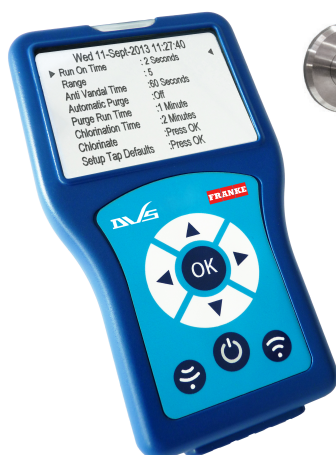
AT07-101 EZ HC Spout - 90° Tap Spout