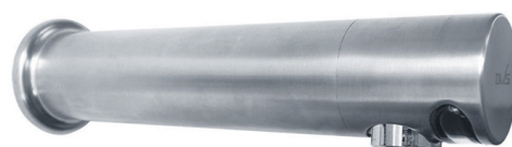
AT02-011 Aquarius WM Tap 200 mm-Brushed