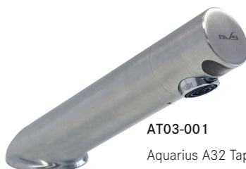
AT03-001 Aquarius A32 Tap - Brushed