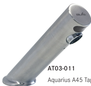
AT03-011 Aquarius A45 Tap - Brushed