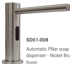
SD01-008 Automatic Pillar soap dispenser - Nickel Brushed finish