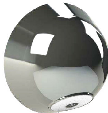
ABS Dome showerhead SH07-085