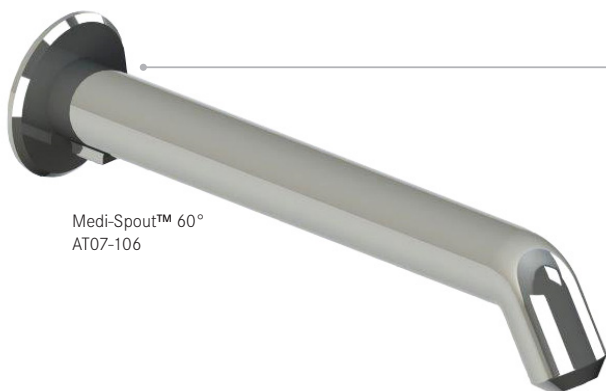
Medi-Spout™ 60° AT07-106