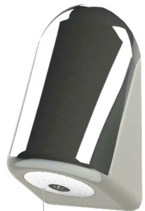
ABS Sloped showerhead SH07-086