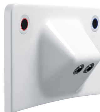
Sensors not supplied with backplate