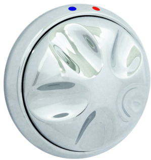
SH00-011 TEMPERATURE BLENDING VALVE ADJUSTER

In many public areas supplying water at 41°C is sufficient. If however, the requirement is to provide 41°C with user adjustment between this temperature and cold (determined by the cold input temperature), The temperature blending valve adjuster can be used to accommodate this facility.